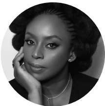
CHIMAMANDA NGOZI ADICHIE Writer and novelist

And there is much more to get excited about – in our science track you will find a plethora of paper presentations exploring the frontlines of architecture and sustainability. We are designing several Next Gen-sessions powered by students and young professionals, and we are talking to a great many high-profile firms and organizations from architecture and the built environment about hosting sessions.