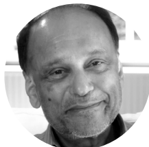
PARTHA DASGUPTA Economist and Professor, University of Cambridge