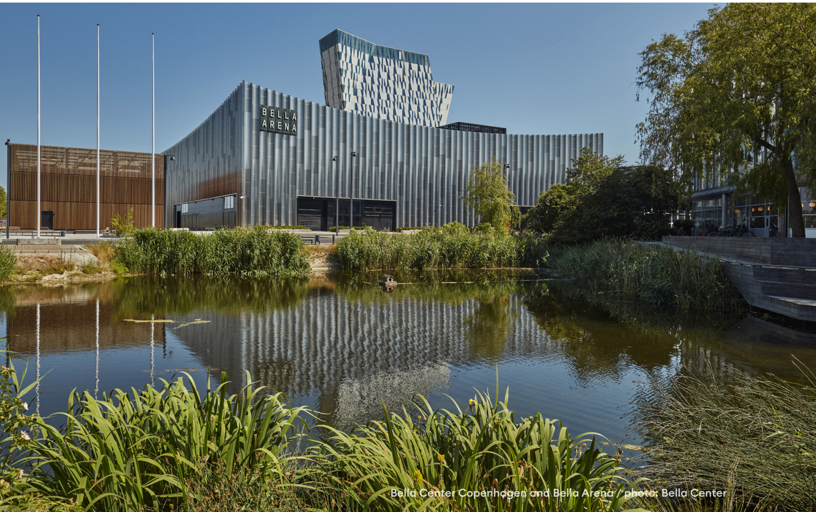
Bella Center Copenhagen and Bella Arena

The UIA congress in 2023 takes place at Bella Center Copenhagen – Scandinavia’s largest conference and exhibition center, located 10 minutes from CPH Airport and 10-15 minutes from Copenhagen City Centre by Metro.