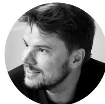
BJARKE INGELS Architect and Founder, BIG