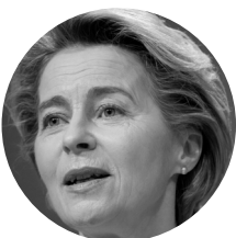
URSULA VON DER LEYEN President of the EU Commission