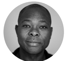
FRANCIS KÉRÉ Architect and Founder, Kéré Architecture