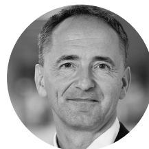
JIM HAGEMANN SNABE Chairman, Siemens