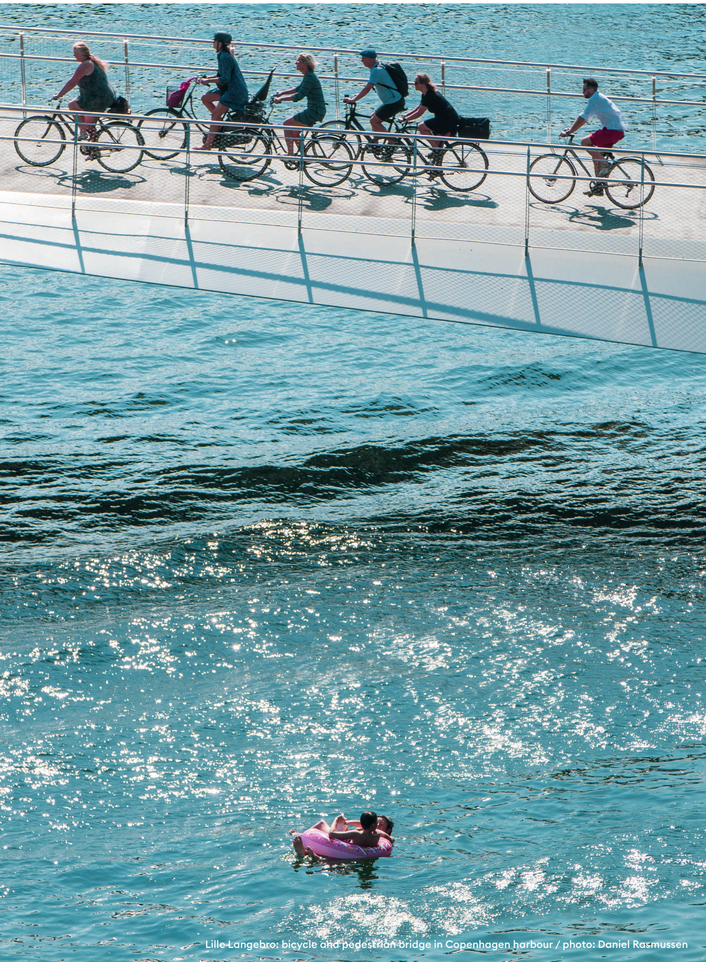
Lille-Langebro: bicycle and pedestrian bridge in Copenhagen harbour