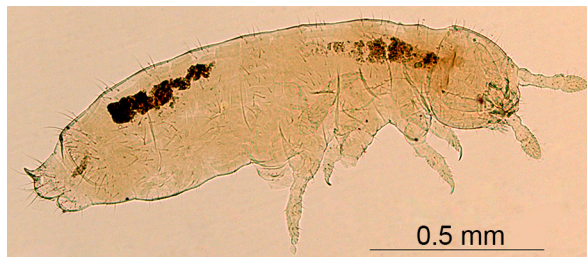
Fig. 1. Habitus of Heteraphorura iranica from Kolkheti Lowland, Georgia.

Рис. 1. Габитус Heteraphorura iranica с Колхидской низменности, Грузия.